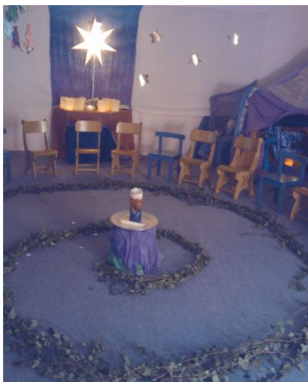
Playgroup spiral walk, 2014